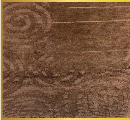
Corner Photo of the Custom Design Crafted from 100% Hand Spun Wool

This beautiful Tibetan rug is produced in Nepal by Tibetan artisans who have been crafting heirloom rugs for generations, creating some of the finest rugs in the world.